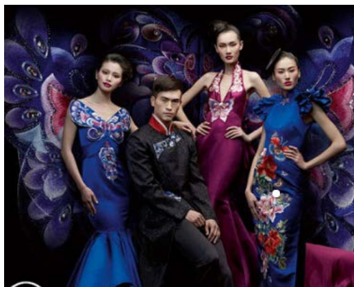
Figure 2 Modern Fashion in Fashion Design